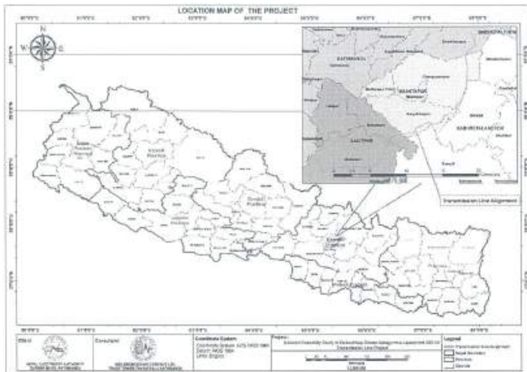
Figure: Project Location Map