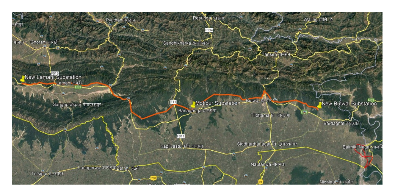
Figure 1-1: Location of Transmission Line Alignment in Google Earth Image